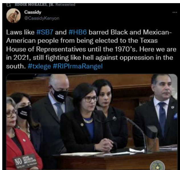
(Eddie Morales Jr. Twitter , 5/7/21)

Morales retweeted a tweet comparing SB 7 and HB 6 to the laws that barred minorities from being elected to the Texas House of Representatives.