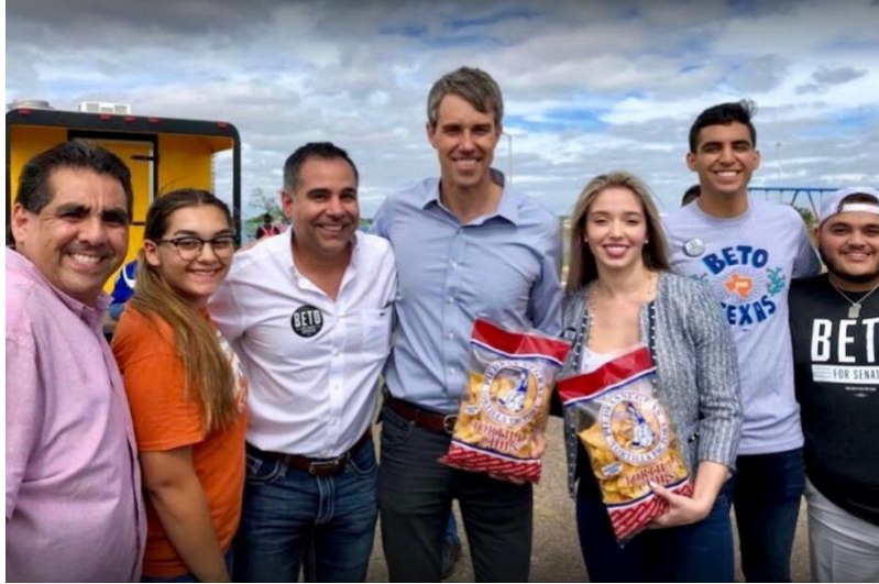
(Piedras Negras Tortilla Factory, Access 1/19/22)